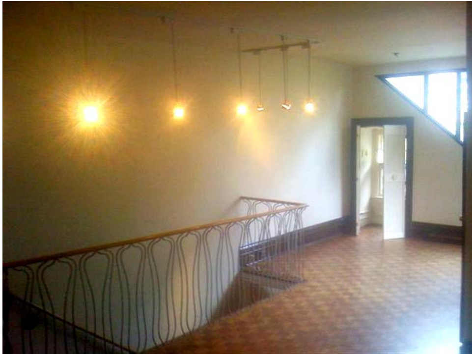
Open Area, 3 rd Floor