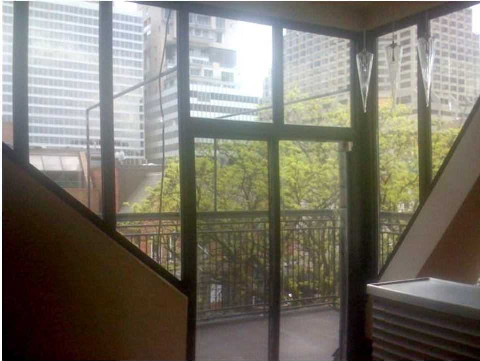
Sundeck South Facing, 3 rd Floor