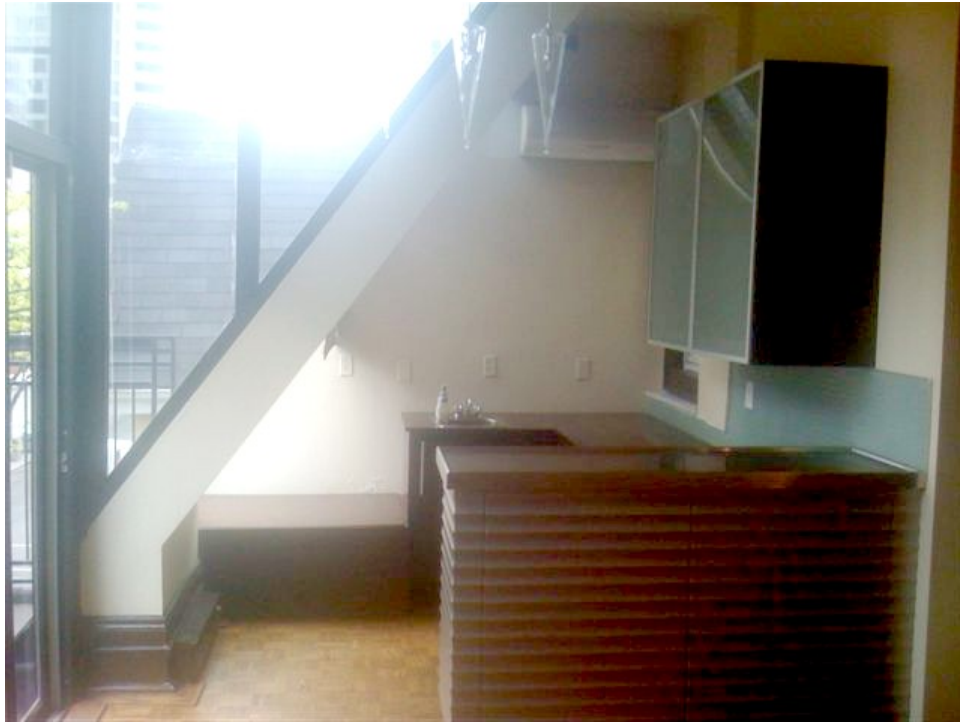
Bathroom, 3 rd Floor