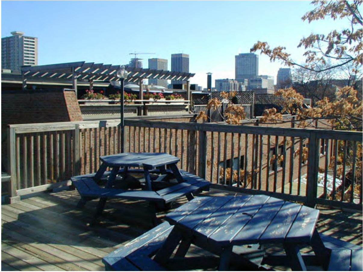
Patio View to South-East