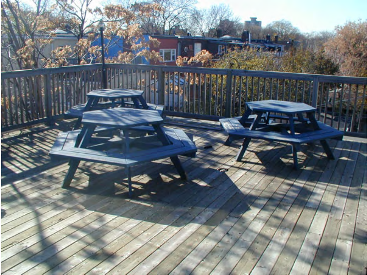
Patio View to West